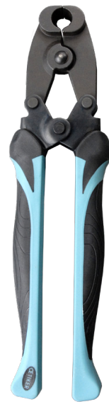
Compound Action Pincers