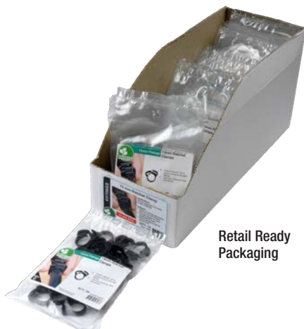
Retail Ready Packaging

Home gardens and landscaping applications.