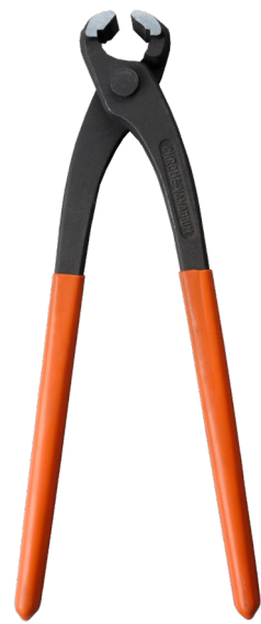
Dawn Industries Crimpers